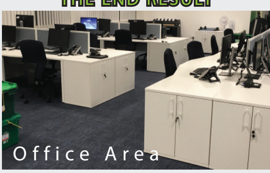
THE END RESULT