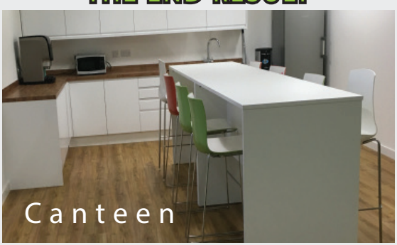
THE END RESULT