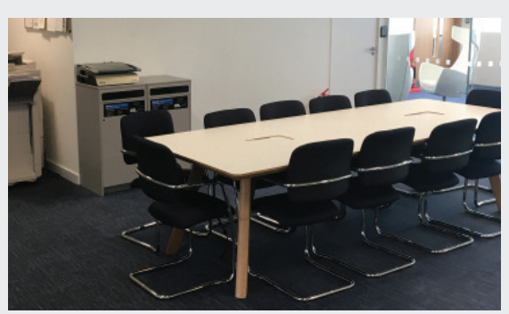
THE END RESULT