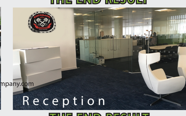
THE END RESULT