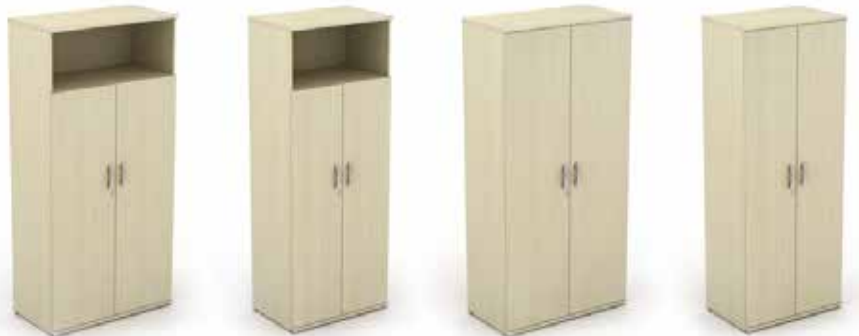
1000mm & 800mm wide open cupboards

(available as 2062mm, 1657mm, 1252mm, 847mm & 725mm high with a choice of handle)