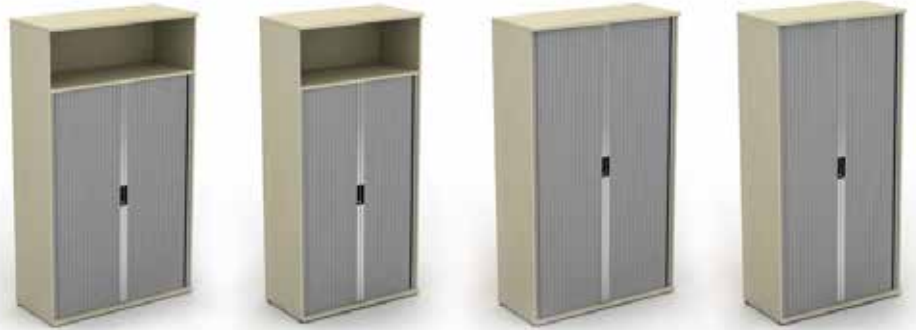
1200mm & 1000mm wide open tambour units

(available as 2062mm, 1657mm, 1252mm, 847mm & 725mm high)