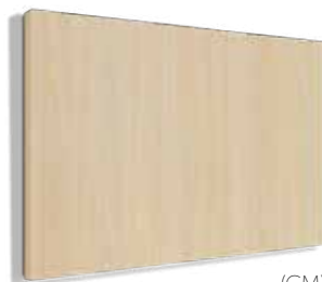
(CM) Canadian Maple