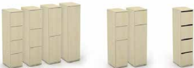
personal lockers available with various door options

(choice of 2, 3, 4 or a single door option)