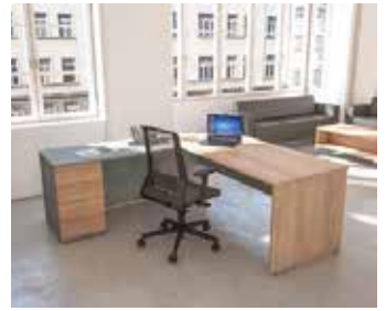
Two tone 1 finish & silver return