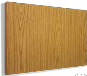
(CO) Calva Oak