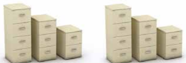
600mm deep filing cabinets (4, 3 or 2 drawers)