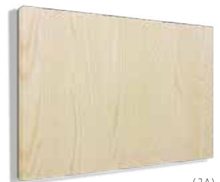
(JA) Japanese Ash