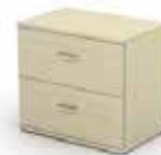
525mm & 600mm deep side filers