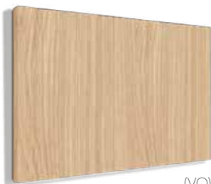
(VO) Verade Oak