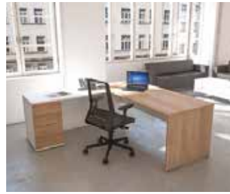
Two tone 1 finish & white return