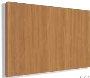
(LO) Light Oak