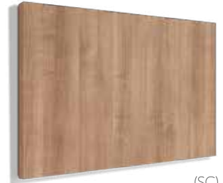
(SC) Santiago Cherry