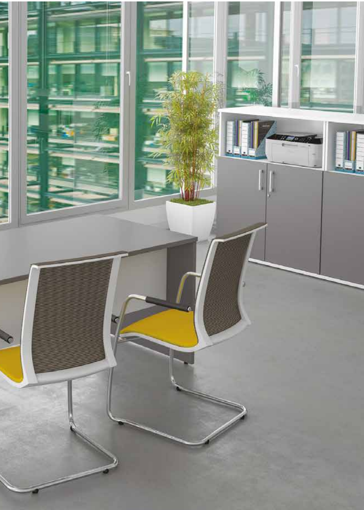
The Fresh seating collection offers modern, stylish seating to complement your new executive workstation.