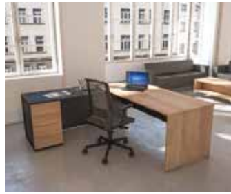
Two tone 1 finish & black return