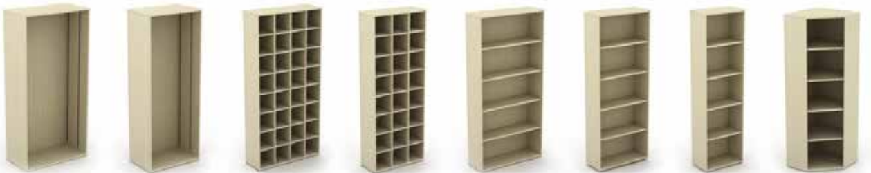
1000mm & 800mm wide open units