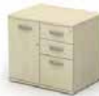
combination cupboard unit