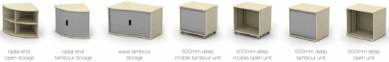
radial end open storage