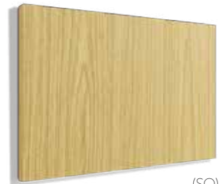
(SO) Stone Oak