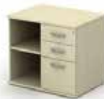
combination open unit