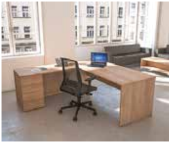
Single tone - 1 finish