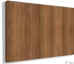
(DN) Dijon Walnut