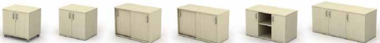
600mm deep mobile cupboard