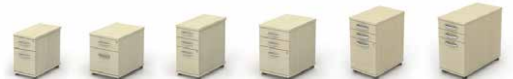
narrow mobile pedestals